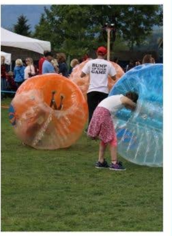
For more information, visit www.goldenspike.ca Subject to change. Parking is limited.